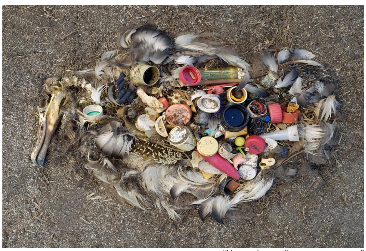
"Nature is sending us a message"